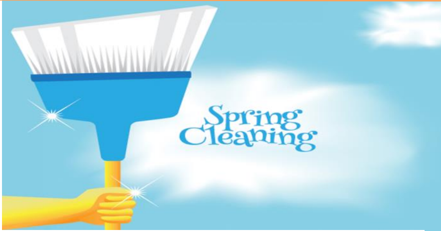
Hand holding a broom and the words "Spring Cleaning"