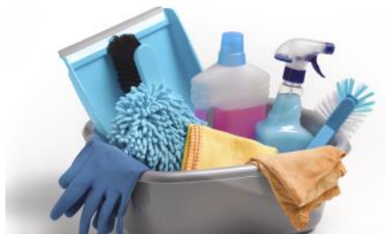
Pail with cleaning items including gloves, spray bottle, towels, dust pan, and scrub brush.

Spring cleaning benefits everybody in the household, so everybody that can participate should. Even the littlest members of our families can join in with age-appropriate tasks. Make it fun! Put on some music to dance to while vacuuming. Add a reward as an incentive to motivate family. Cleaning can also be great exercise.